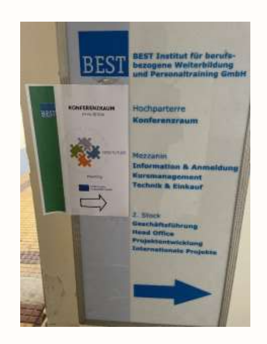
Learning & Training Activity - Vienna, September 2024