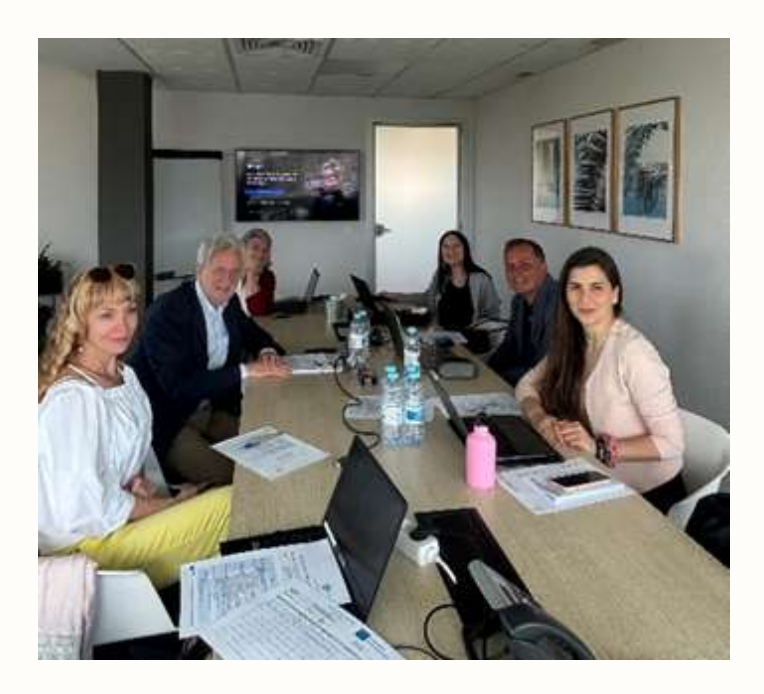
Second Transnational Partner Meeting - Lisbon, May 2024